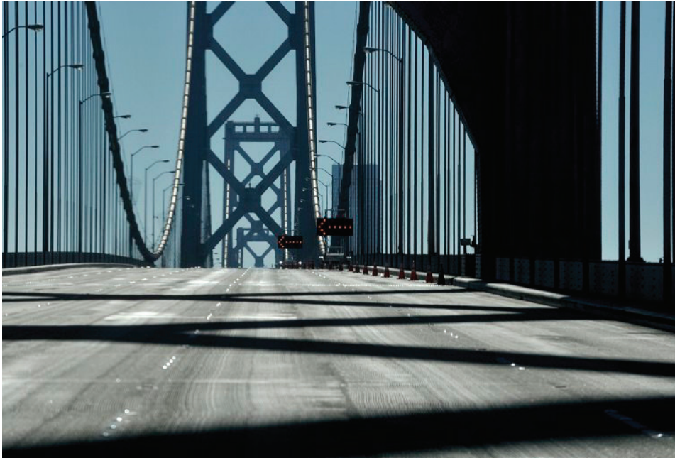
The Bay Bridge in San Francisco, closed.